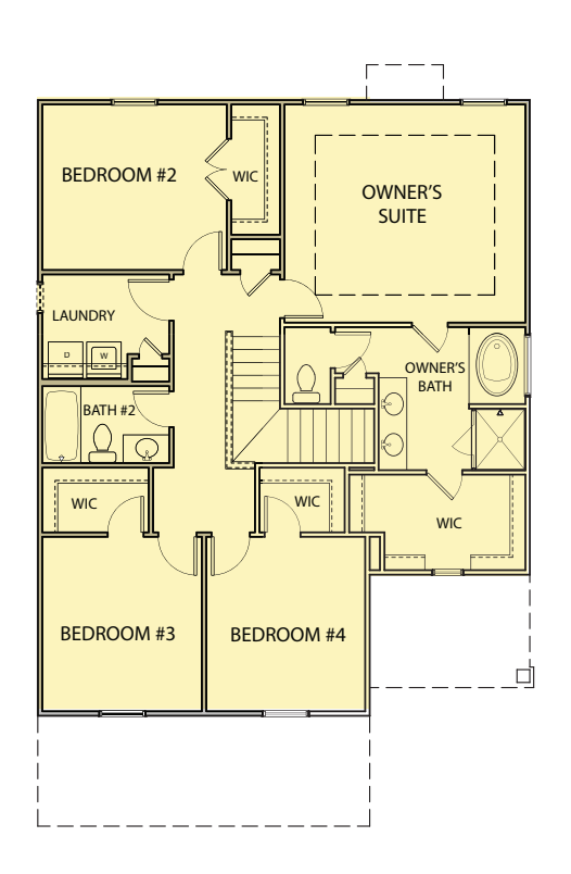
Opt. Covered Porch